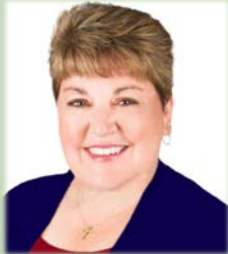
Mayor Julie Maas-Kusske